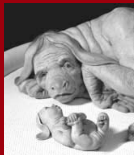
Patricia Piccinini, The Young Family 2002. Silicon, polyurethane, leather, human hair.