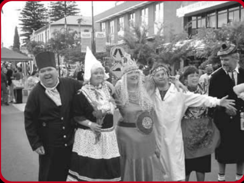
Awakenings Roberts Place, Awakenings Festival 2003.

Most international and domestic literature focuses on the participatory arts in a community setting, when examining social impact/health outcomes.