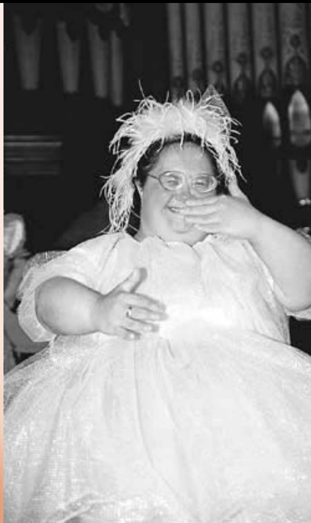
Awakenings Festival 2002 In the Arts There is Only Ability, Dr Coppelia's Toys.

If Piccinini's 'life forms' were flesh and blood would they be loved? ■